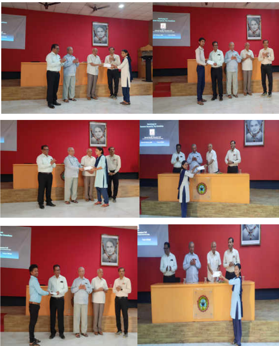
Scholarship distribution to the scholars who completed In-house Summer Research during 2021-22