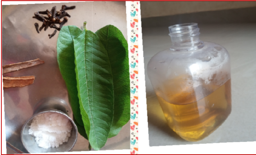
1. Mouth wash prepared from Clove, Gauva leaves, Cinnamon and salt (Student who prepared : Ankita D Kale)

Some of the glimpse highlighting the students activity during summer research are appended below: