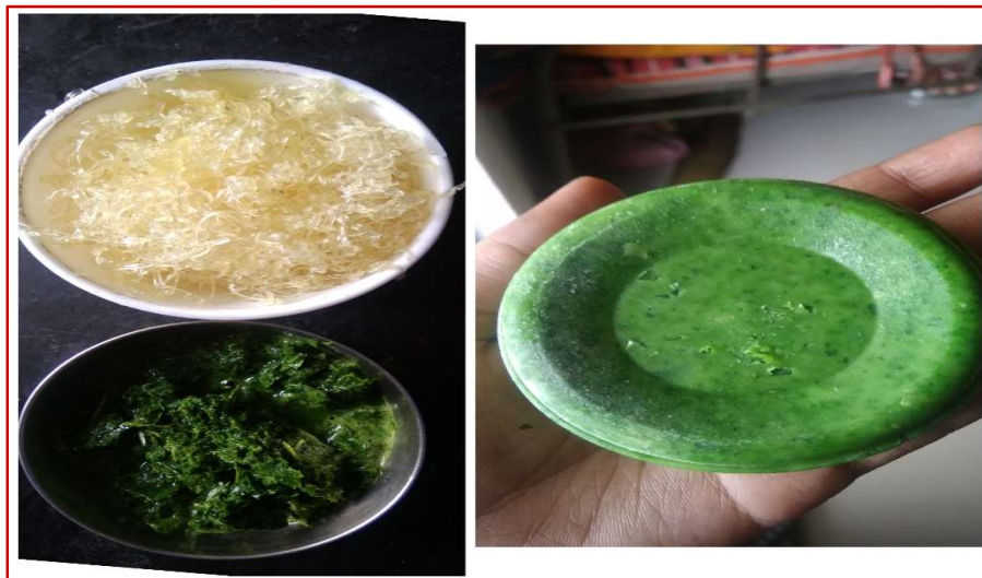
2 Preparation of Neem soap